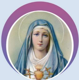
Mother of Sorrows MSFS PATRONESS