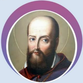
St. Francis De Sales MSFS PATRON